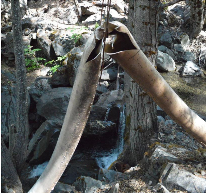
Burned pipes that fed the Hammerhorn Lake prior to the 2020 August Complex