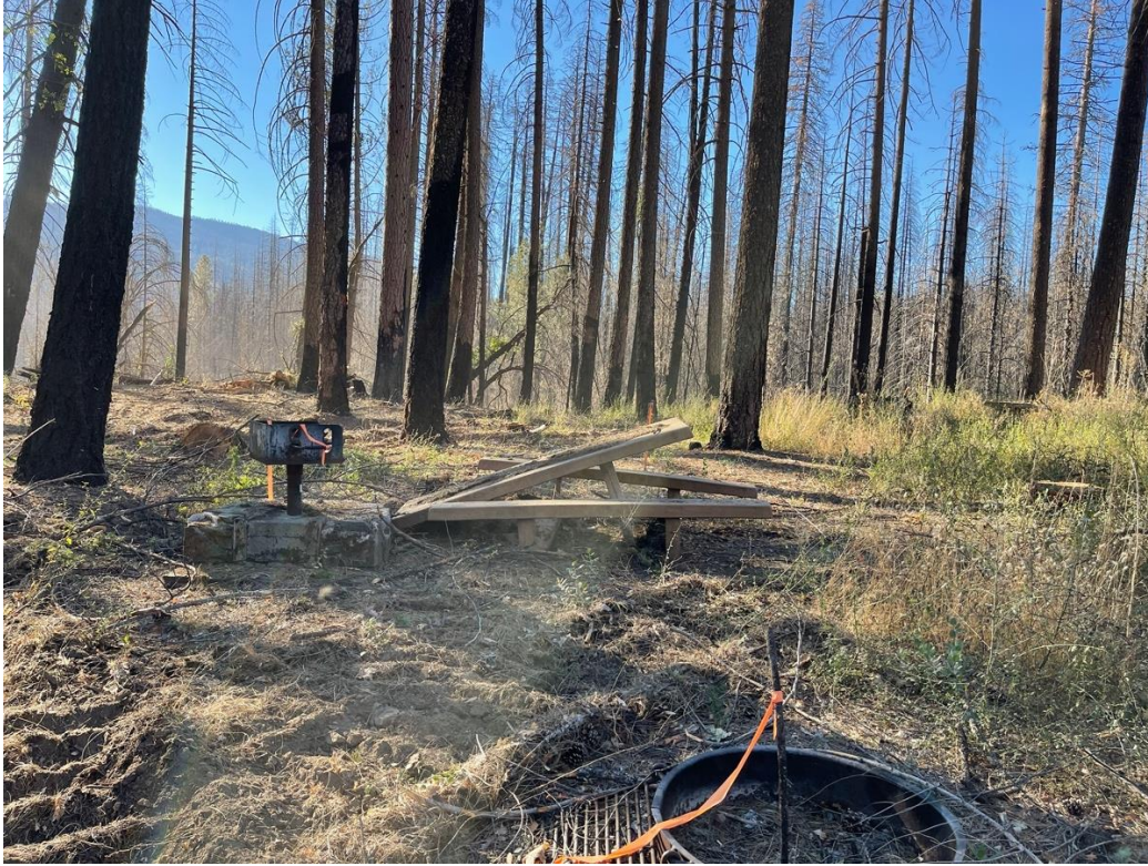
Campsite with overgrown weeds and vegetation that will be treated/removed

Handicap accessible bathroom to be restored with a new breather pipe and additional interior maintenance