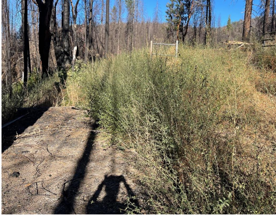
Remnants of the handicap accessible pathway to the lake that was destroyed in the 2020 August Complex