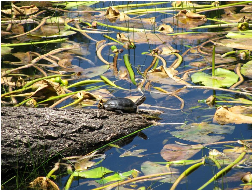
Western Pond Turtle in Hammerhorn lake before the 2020 August Complex