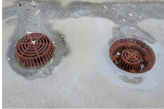
Roof Drain & Overflow Inlets. Typ.