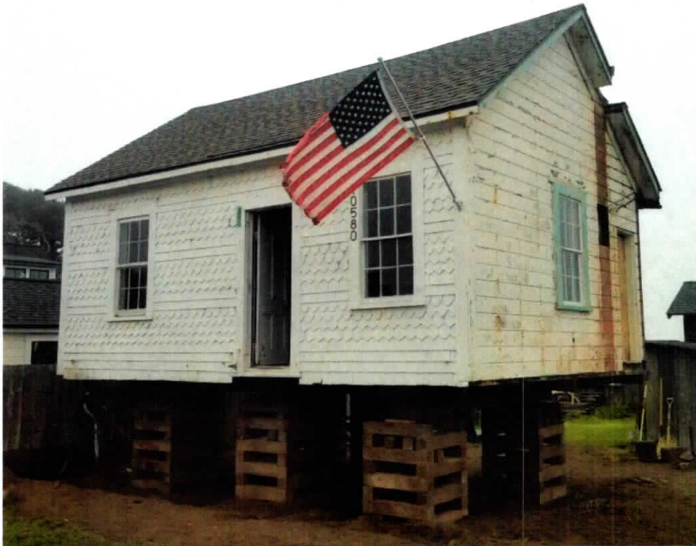
StaffThe house at 10580 Kelly Street.

Today the house sits on the verge of the Mendocino headlands, looking to the north and west at ocean and sky, with the Point Cabrillo Light Station for perspective. But it is also entwined with Mendocino's history; built when the headlands were still part industrial site, and Mendocino, according to a history written at the time, was a town "garnished with a veritable forest of windmills."