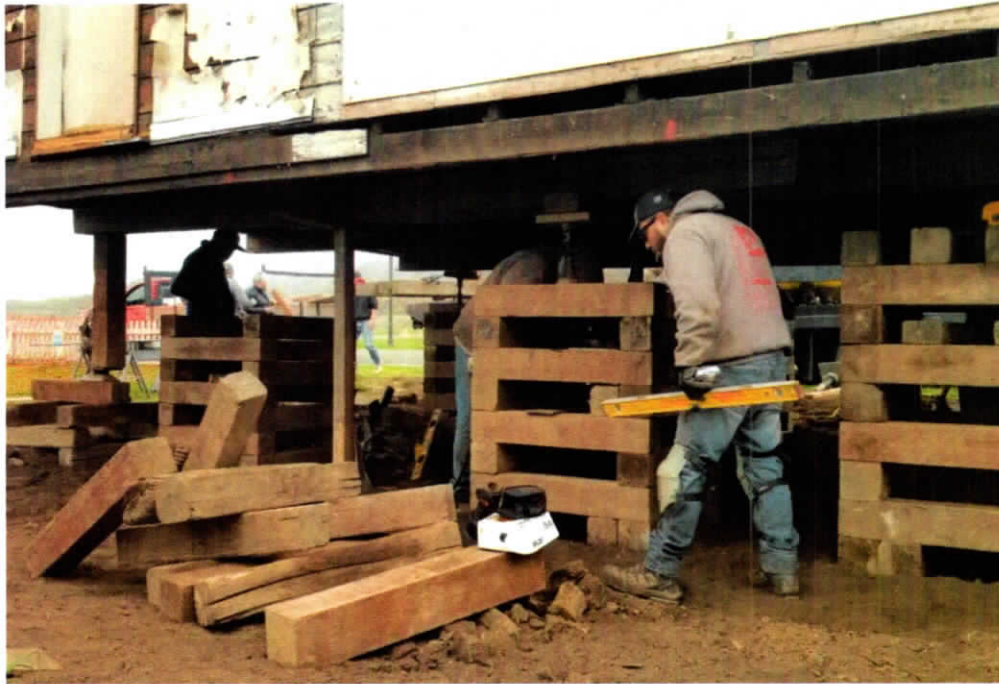
StaffWorkers from Wacker and Sons of Penngrove handled the house-lifting.

The house occupies a neighborhood once known as “Portuguese Flats,” first built in the late 19th century next door to the town’s original, gigantic sawmill, which was surrounded by a large industrial expanse for shipping and storage. The home’s style of construction is typical of, and unique to, Mendocino mill cottages – part New England fishing village, part old country Azores, part on-the-spot invention.