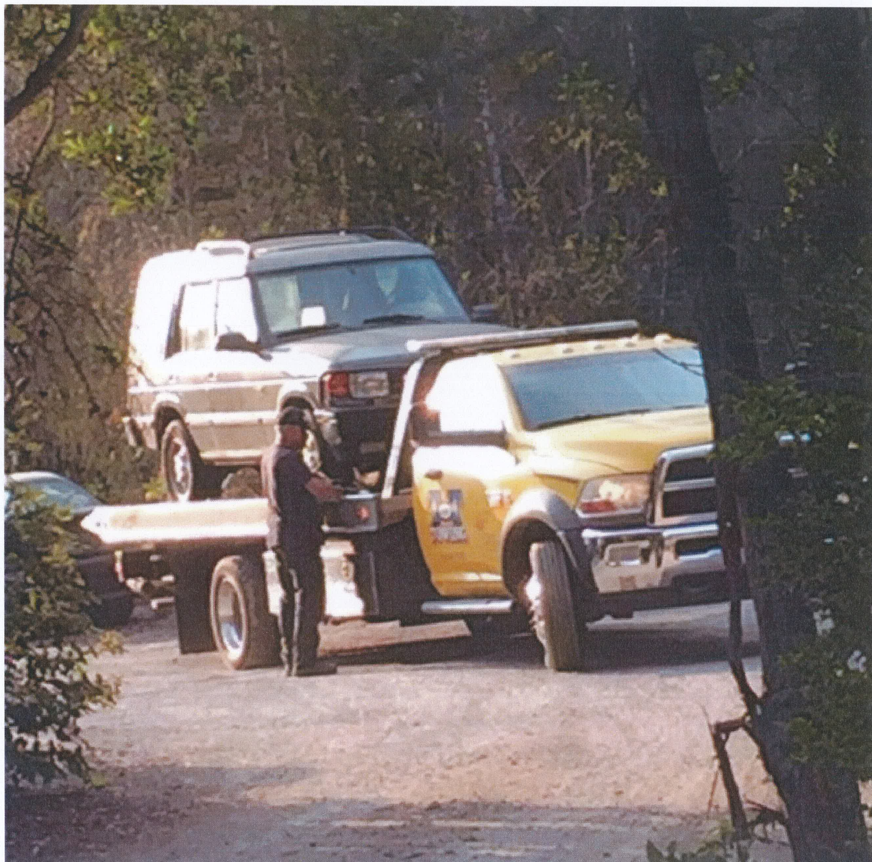
Please post for public review. Picture taken 8-23-2020@6:43 p.m