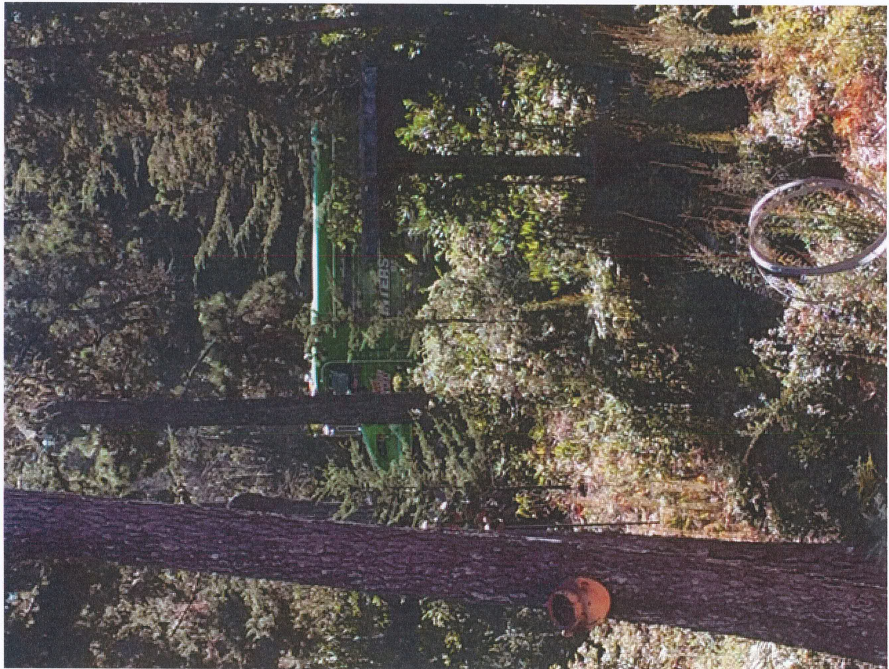
Another Interstate Battery delivery. Picture taken 10-21-2020@12:56