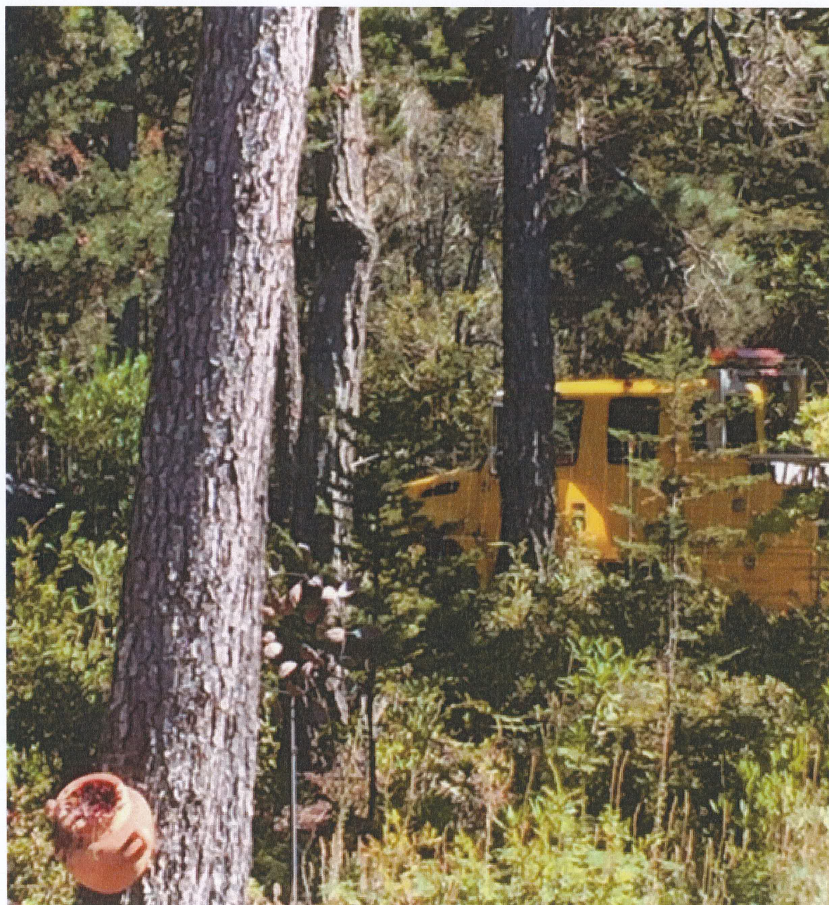
truck leaving after dropping off a car. Taken 8-18-2020 @ 4:00pm