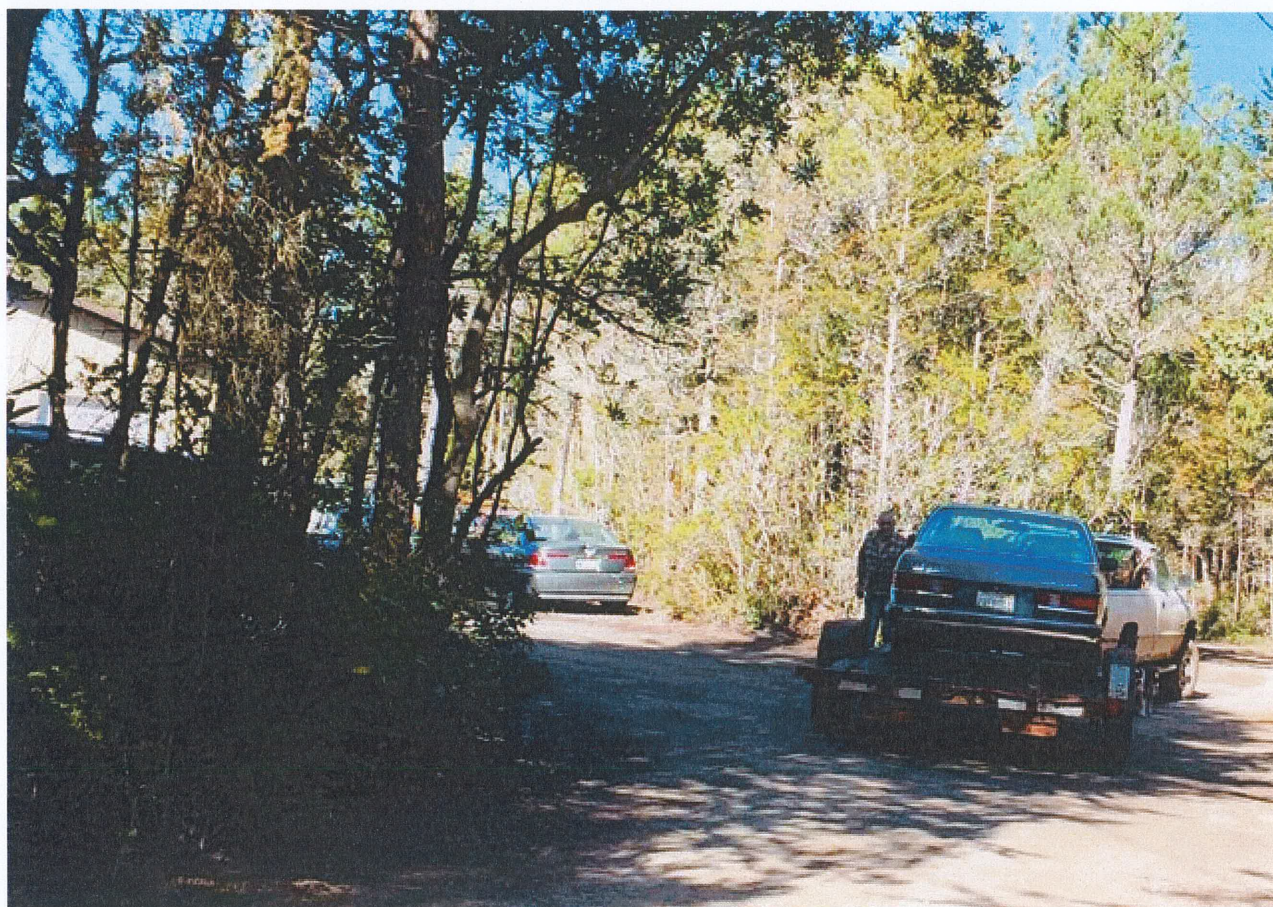
This was taken 2-18-2020 @10:37