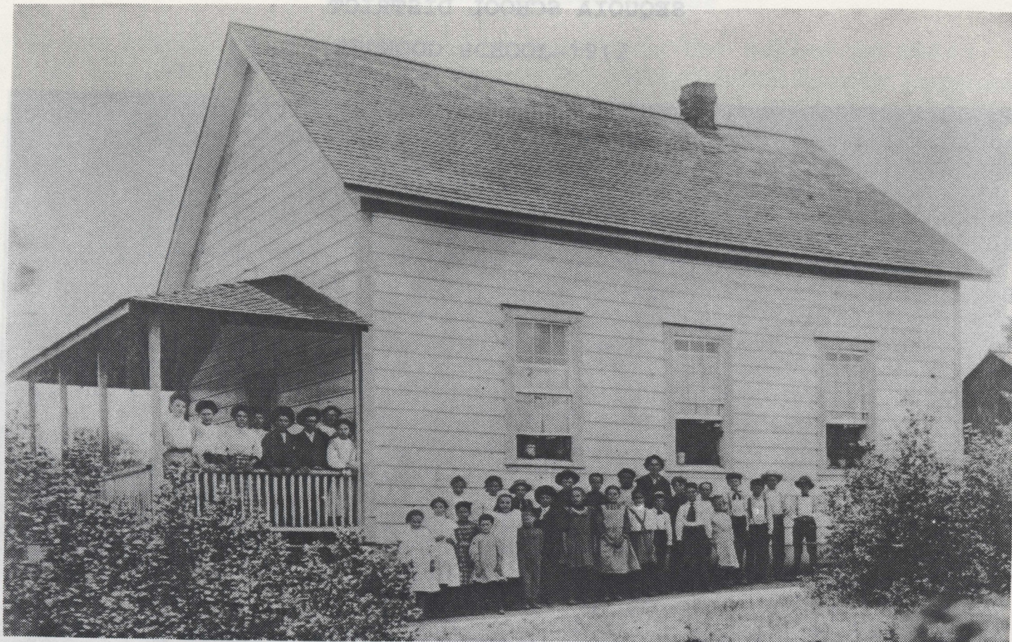
REDWOOD VALLEY SCHOOL ca 1940's