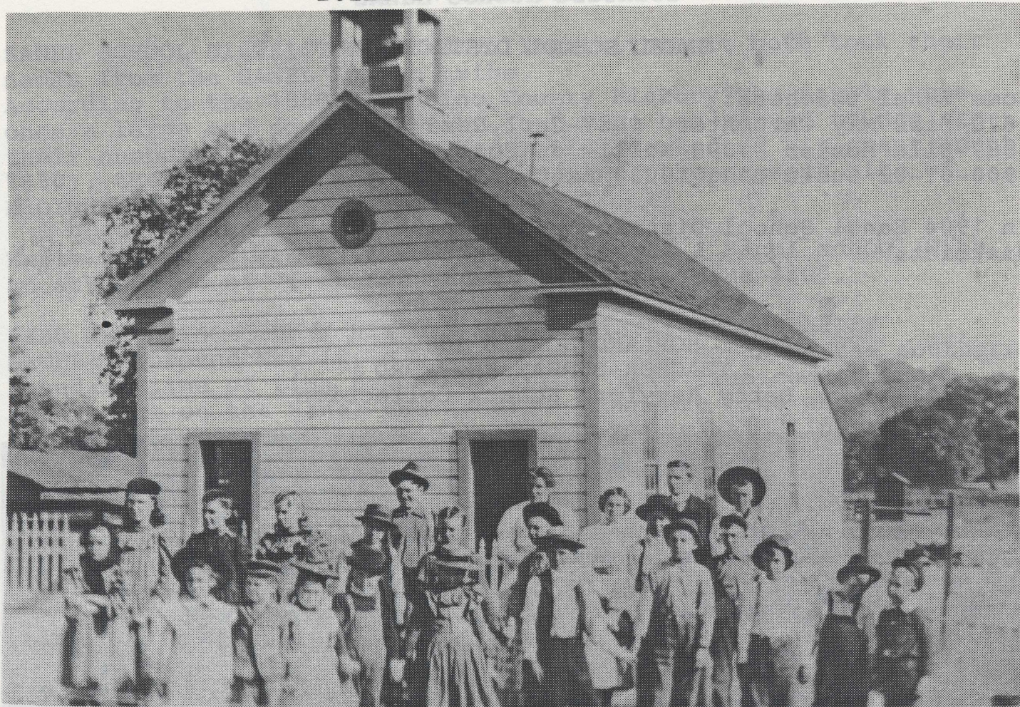
HOPLAND GRAMMAR SCHOOL ca 1921