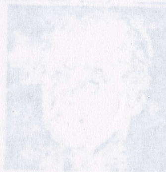
Blanche Brown, beloved teacher Photo