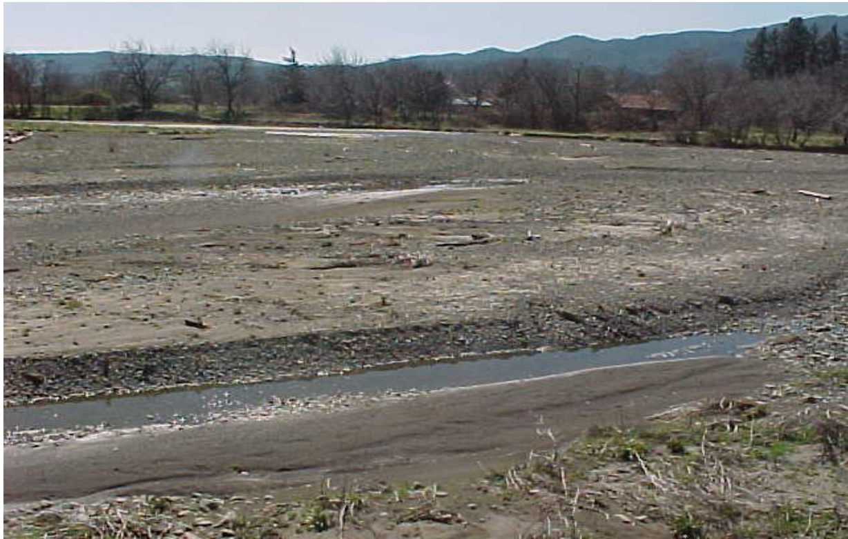
Picture 1. Mill Creek – BEFORE Restoration efforts! (Thrashers corner to right)