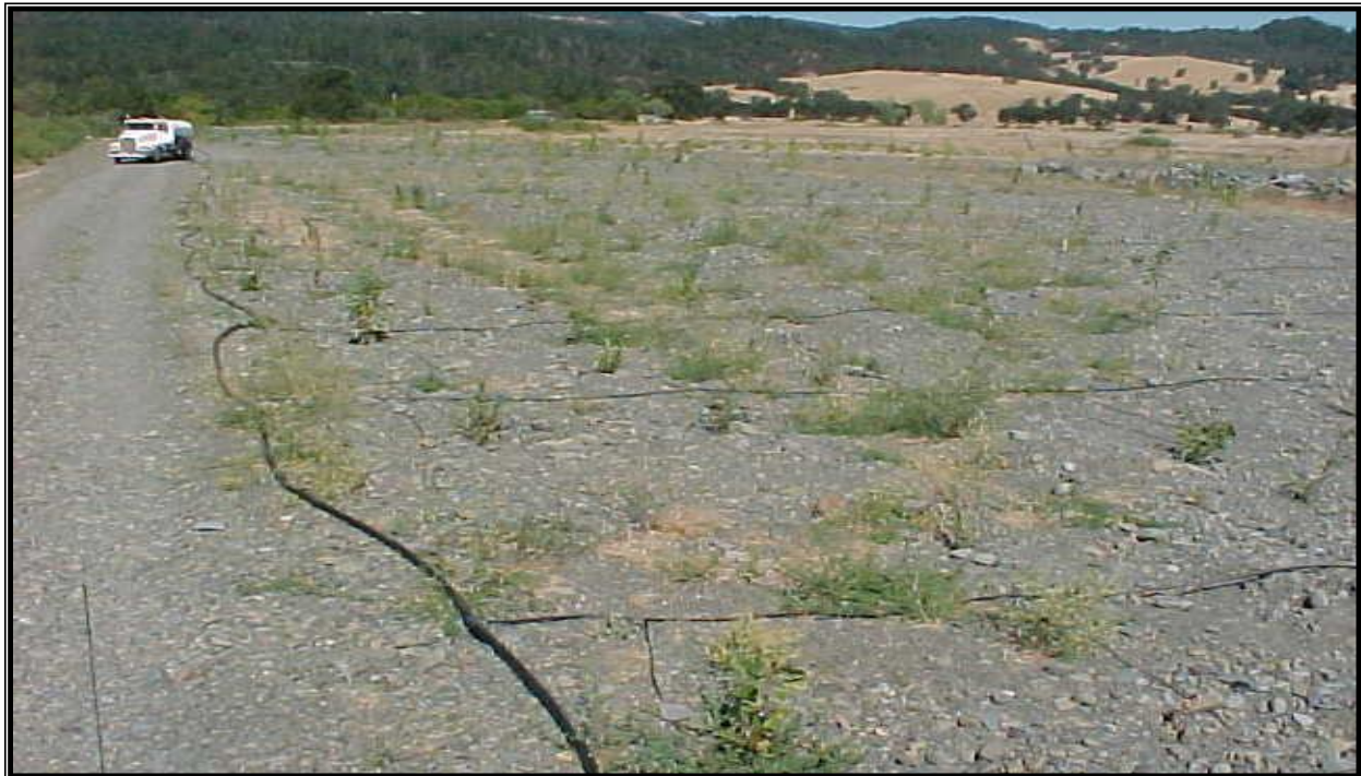
Picture 11. A watering "Cell" can covers a length of ~500' and width of ~ 125' outward from the stream bank and contain hundreds of planted trees, shrubs or Willow Walls.