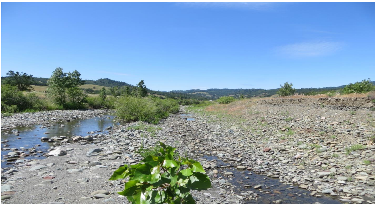
Picture 8. Elgin site 2 – Waterflow has gotten behind the vegetation last winter and seems to be trying to establish itself here. Development of deflectors at the upstream end and a series of weirs downstream will help direct the flow back to the left and naturally deposit materials to the right.