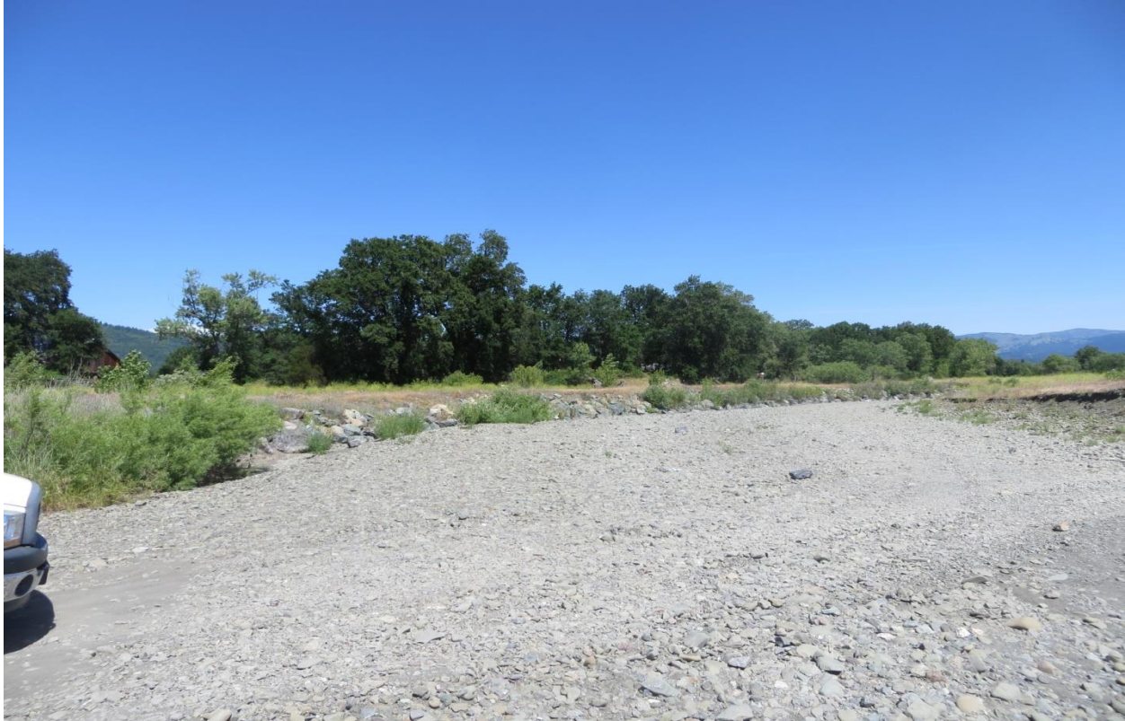
Picture 9. “Crawford Crossing” Willow Walls to be planted along inside bend (right side) to prevent stream bank erosion and serve as a vegetated buffer during high water flow events at this floodplain entry point site.