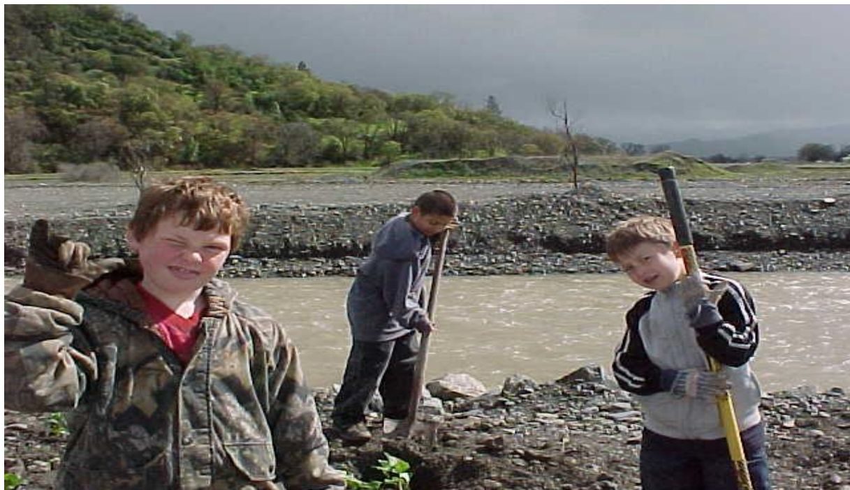
Picture 14. School kids planting vegetation downstream of Medicine Hill following channel development efforts associated with stream restoration. School involvement for education and planting activities has been an annual goal since the Projects inception in 2000!