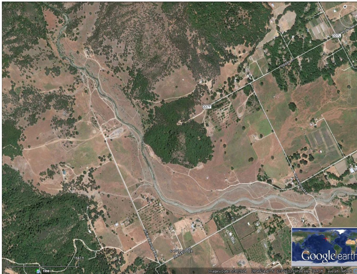
Figure 2. Aerial photo of the entire Mill Creek Project Area – 2014. Note the visible riparian vegetation along Mill Creek West and North of Medicine Hill (center) and the remaining need for vegetation for riparian development South and East of Medicine Hill