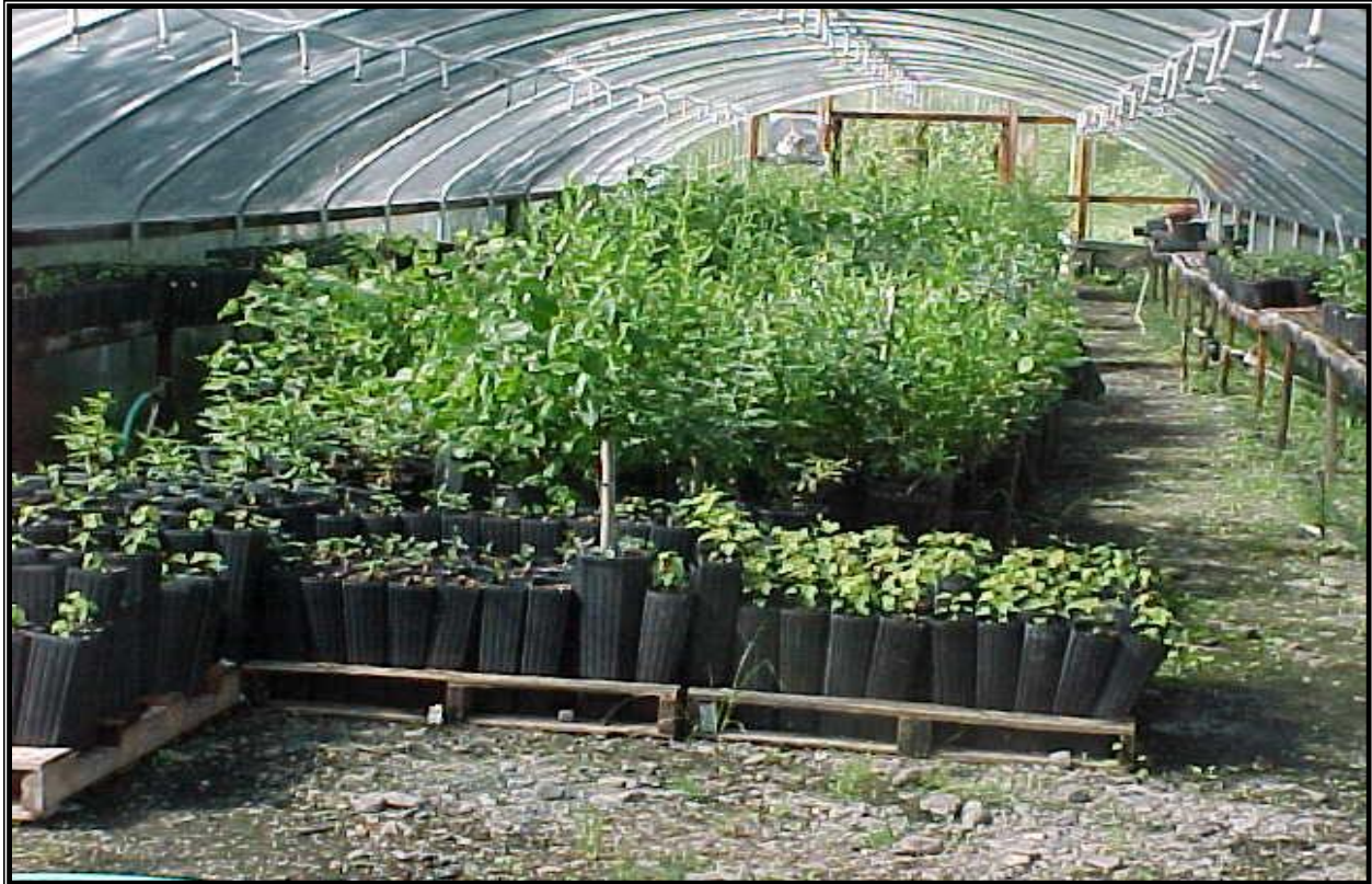
Picture 13. The Tribes Greenhouse stocked with a variety of Cottonwoods, Alders, Willows, Buckeyes, et al.