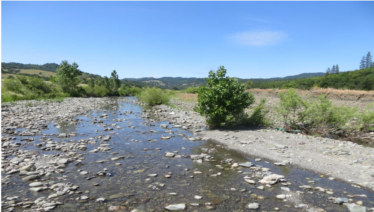
Picture 7. Elgin site 1 – This is the largest of the streambank stabilization sites that will utilize Willow Walls and Willow Weirs to protect the banks and capture/deposit sediments.