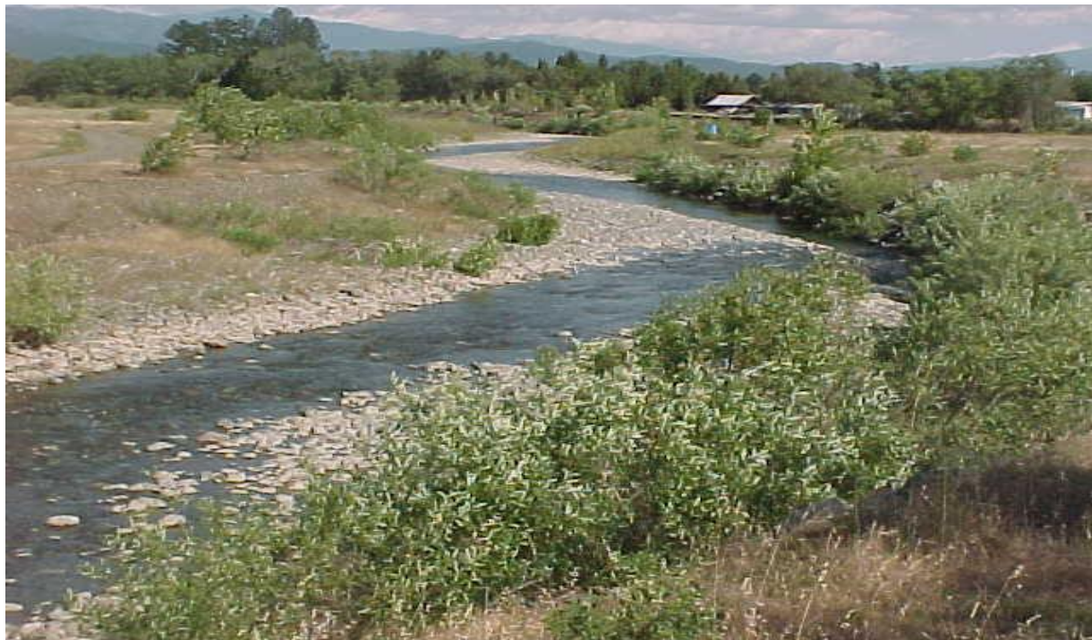
Picture 2. Mill Creek – 2 years AFTER Restoration! (Thrashers corner to right)