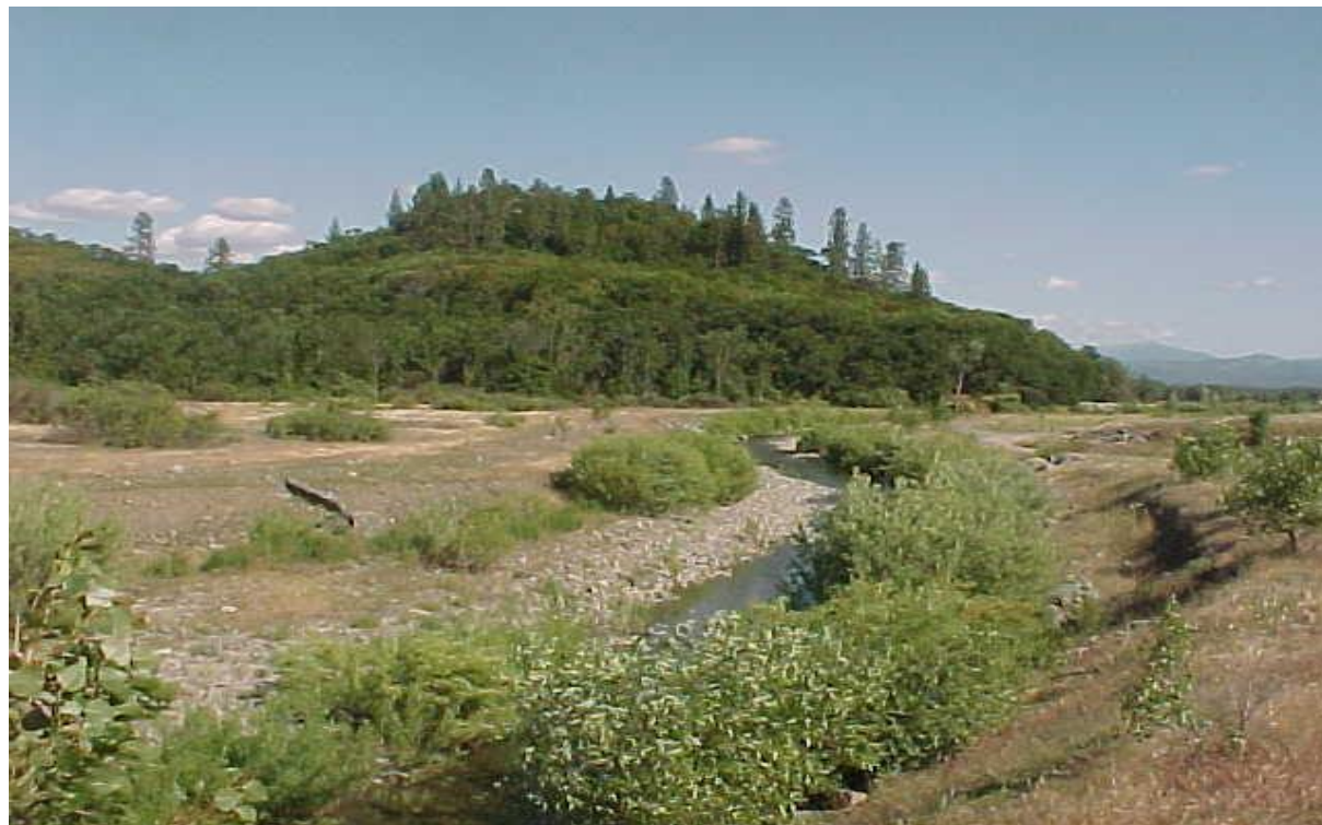
Picture 4. Stream conditions in Phase 2 “After” Restoration Efforts upstream of Medicine Hill. Note the Willow Walls planted along the active channel and several young cottonwood sprigs growing above bank-full level. Today some of these trees are 30’ tall.