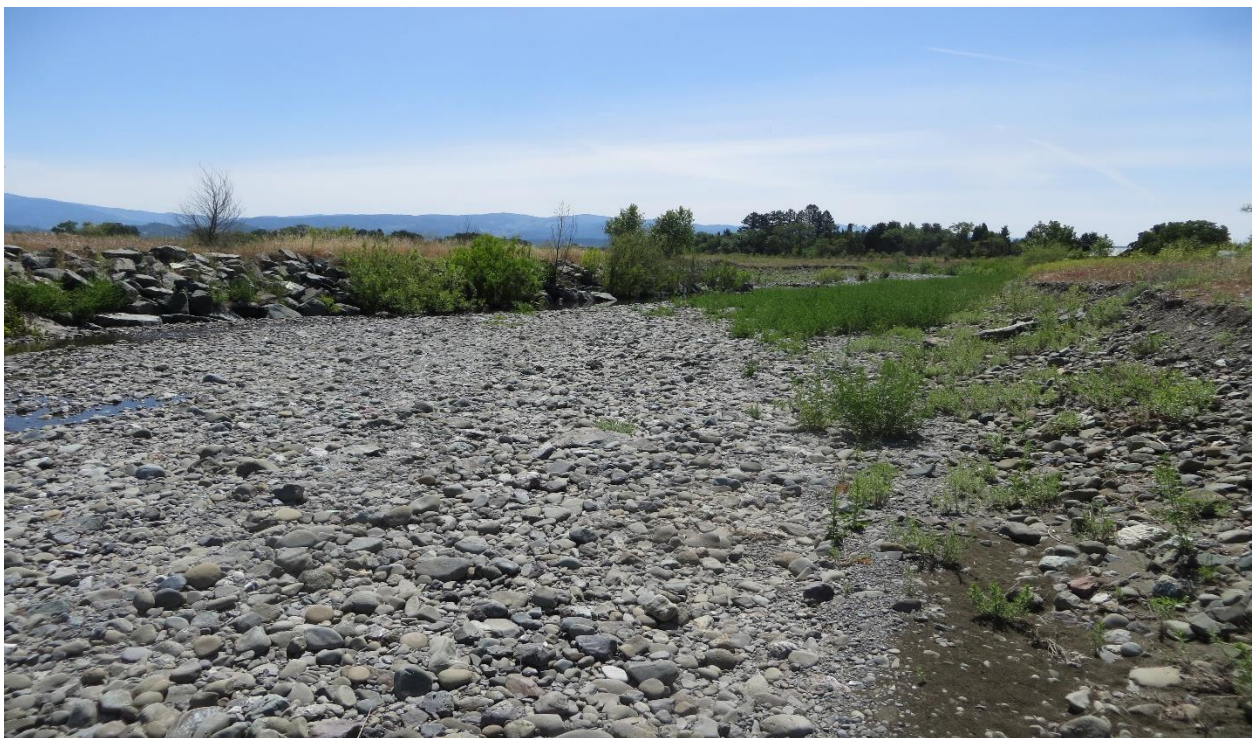
Picture 10. “Swensons Bank” - Willow Wall site to be planted at base of stream bank slope.