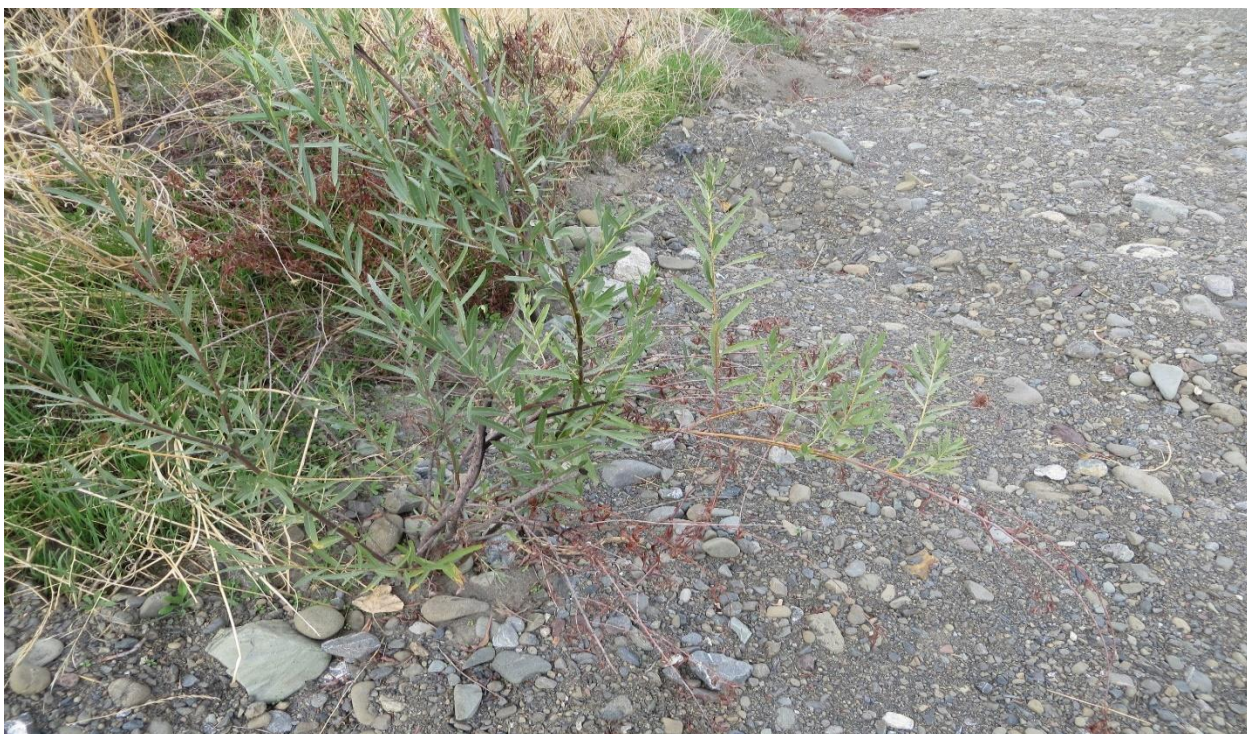
Picture 12. Example of Willow Wall planted early in the spring as it looked later in the Fall, note new vigorous growth!