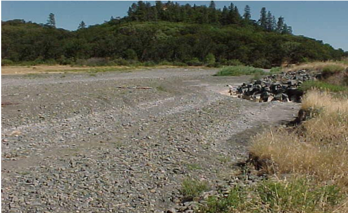
Picture 3. Stream conditions in Phase 2 “Before” Restoration Efforts upstream of Medicine Hill. Note the lack of channel definition and lack of riparian corridor vegetation.