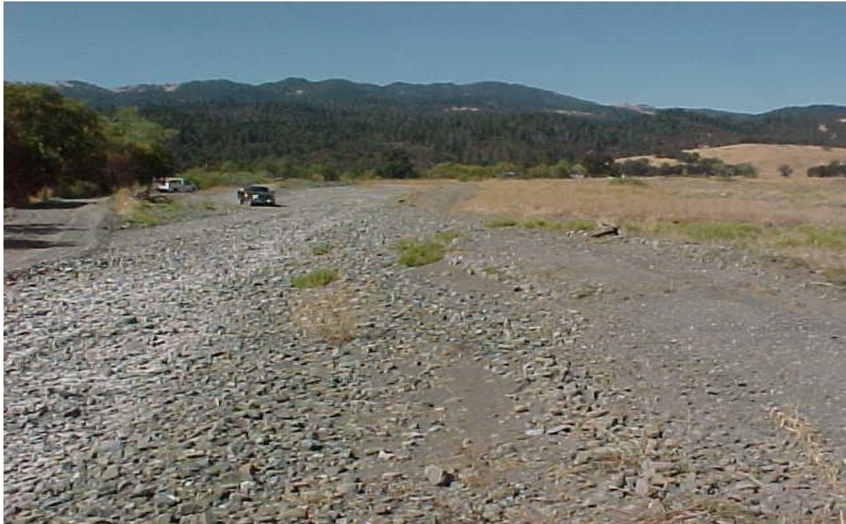
Picture 5. Stream conditions in Phase 5 “Before” Restoration efforts. Note two other active channels off to the right.