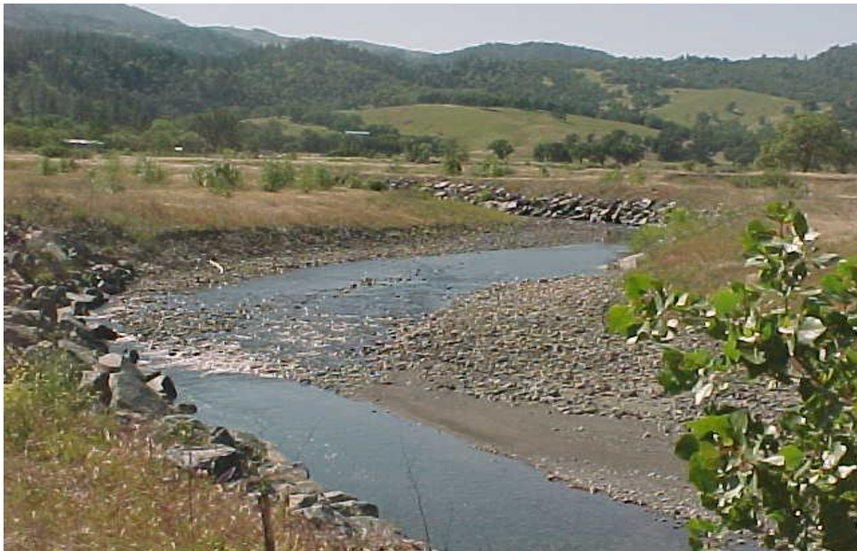
Picture 6. Stream conditions in Phase 5 “After” Restoration efforts. Note the well defined single channel and three year old cottonwood and willow trees growing along the left bank.